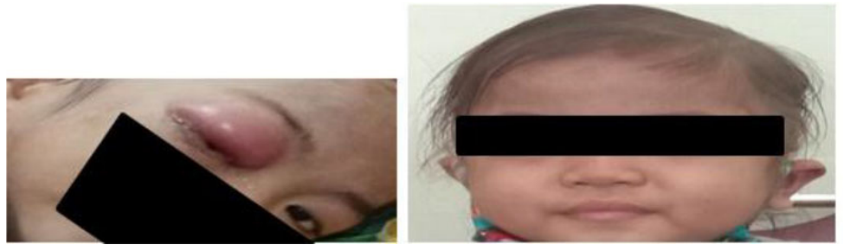
Figure 1. Blepharitis. (A-left) Day-1 before treatment. (B-right) Day-27 after treatment.

The patient was admitted with working diagnosis of RV based on Jones Criteria of major criteria (carditis) and minor criteria (arthralgia, leukocytosis, increased CRP, increased ESR and increased Anti-streptolysin O titer). The patient suffered from RV with heart failure. Prognosis in