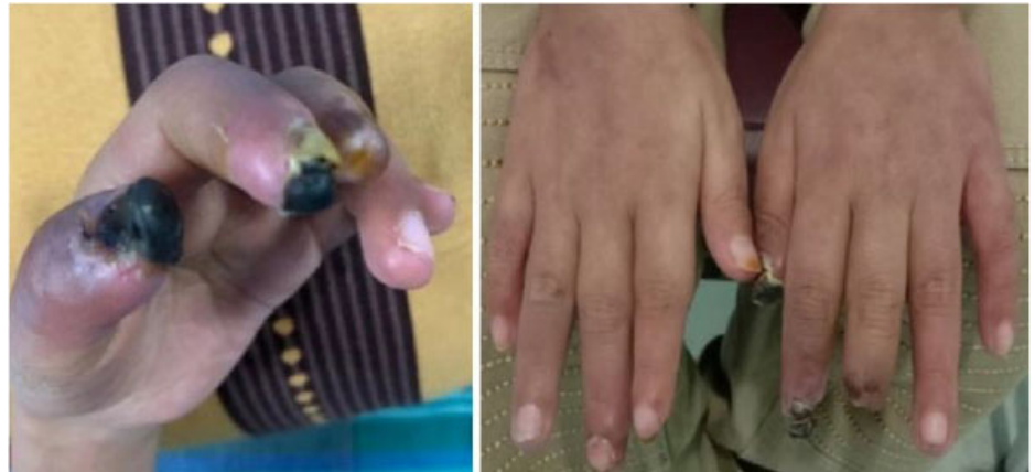
Figure 2. (A-left) RV at admission. (B-right) RV at day-30 after treatment.

this patient dubia because the rheumatoid arthritis already with complication. The treatment were given diuretic, inotropic and ACE inhibitor were given for heart failure. The treatment for RV was prednisone/methylprednisolone 2 mg/kg/day. Erythromycin was given for streptococcus eradication, because benzathine penicillin was not available. Aspirin 350 mg/6hour/oral was given for 3 weeks and prednisone was tapered off. Anemia chronic disease resulting in hemoglobin level of 7,9 g/dl, therefore PRC transfusion was administered.